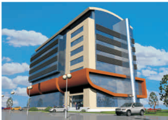
NSPSA new headquarters